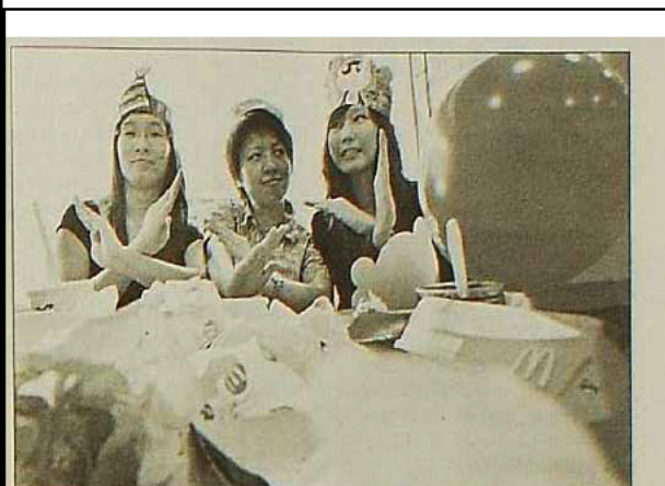
Green Sense members hold an event at a fast food shop to highlight the amount of waste the chain creates.

Source 1 A newspaper extract dated 24 August, 2009 about a protest action made by Green Sense, an environmental concern group, against a fast food chain.