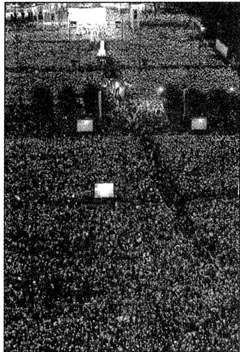
Photograph A: Hong Kong people participating in the June Fourth Candlelight Vigil in the Victoria Park in 2012

Photograph B : Hong Kong people landing on Diaoyu Islands on 15 August 2012